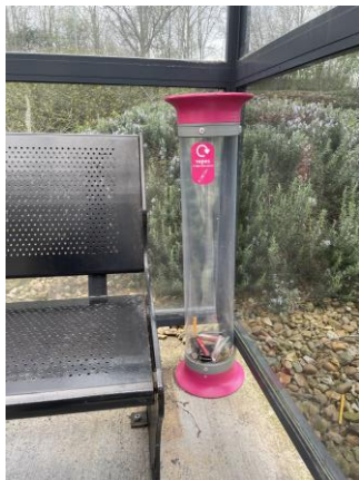
Vape pen recycling