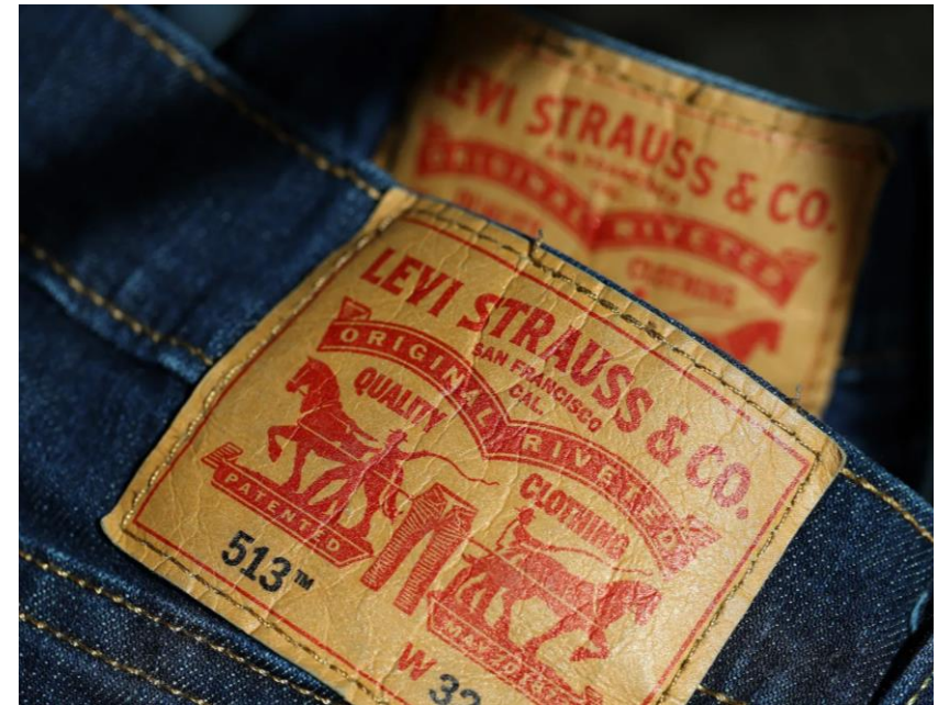
Levi Strauss & Co. product