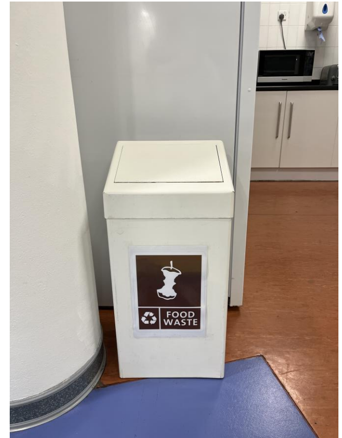
Food waste collection for composting