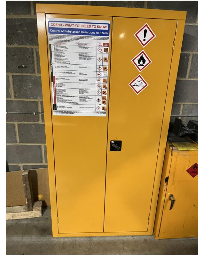
Hazardous waste cabinets