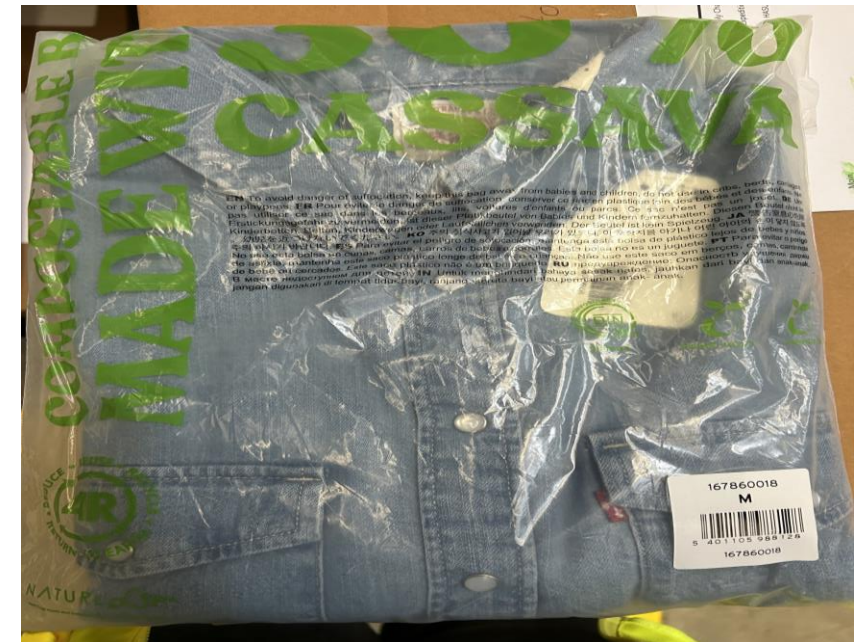
Compostable poly bags