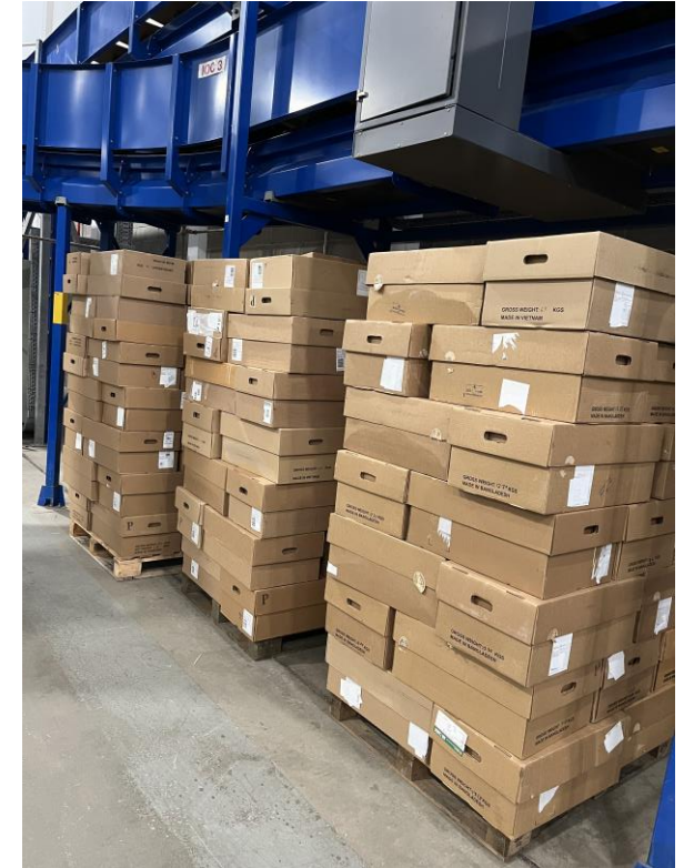
Reusable cardboard boxes in packing area