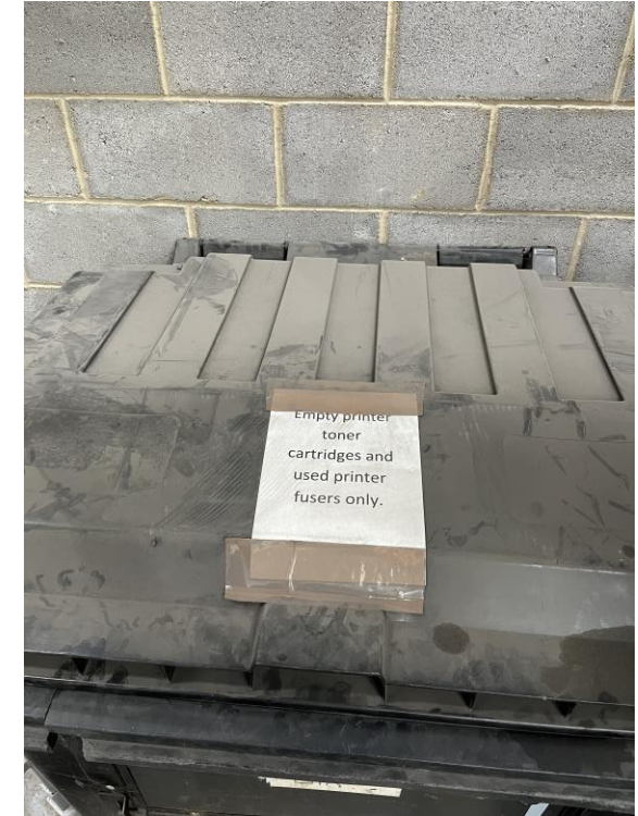
Toner cartridge recycling