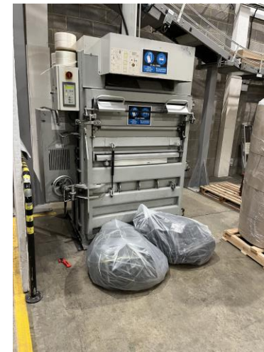
Plastic strap compactor