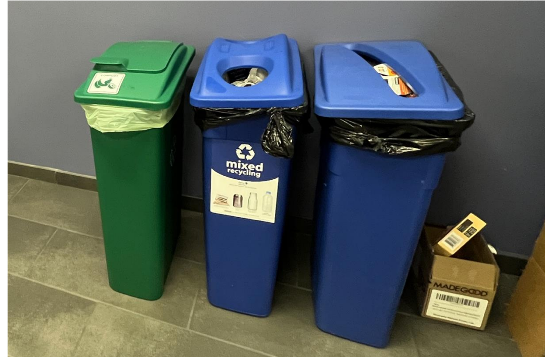
These are our compost bins and recycling bins in the main breakroom