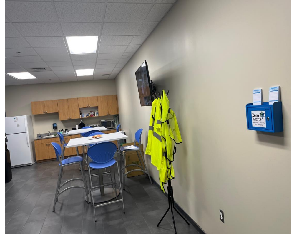
The Comment Box in one of our break rooms