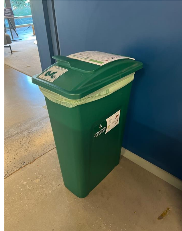
Our 23-gallon compost bin from one of our break rooms