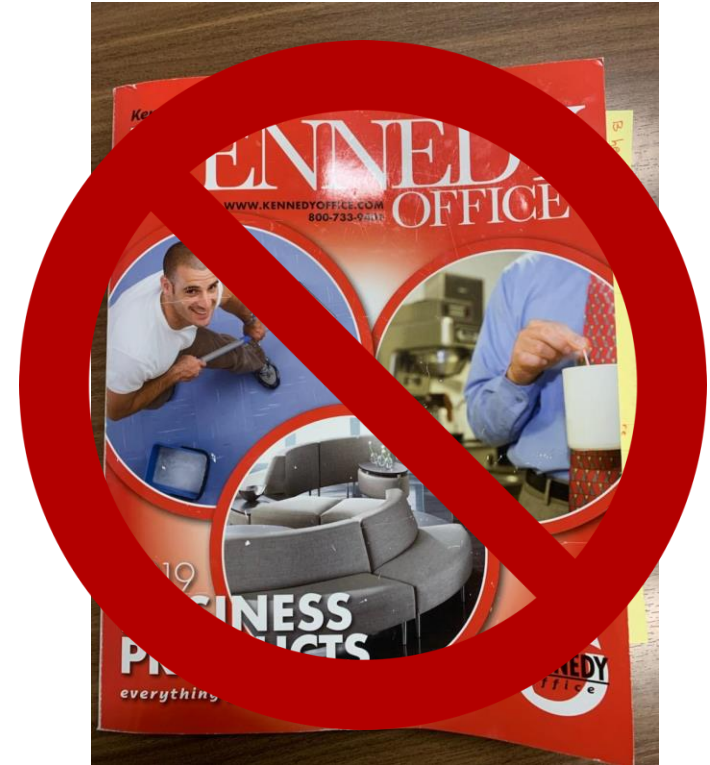
An example of our old purchasing catalog